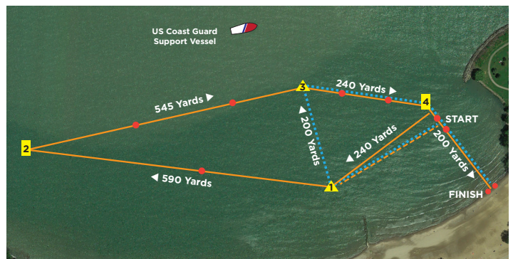
Brogan Open Water Classic course at Edgewater Park. Each lap is approximately one mile.