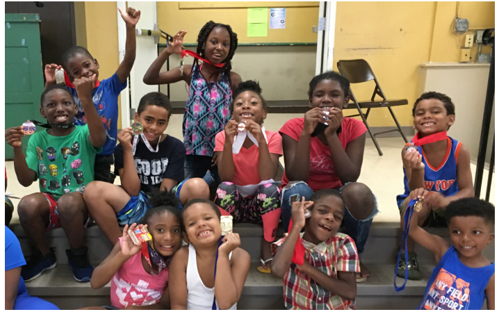
The Brogan Open Water Classic benefits the Malachi Center Urban Kids' Swim Camp. We are proud to be "Big Swimmers helping Little Swimmers."