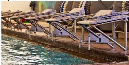
Spectrum Xcellerator Starting Blocks: