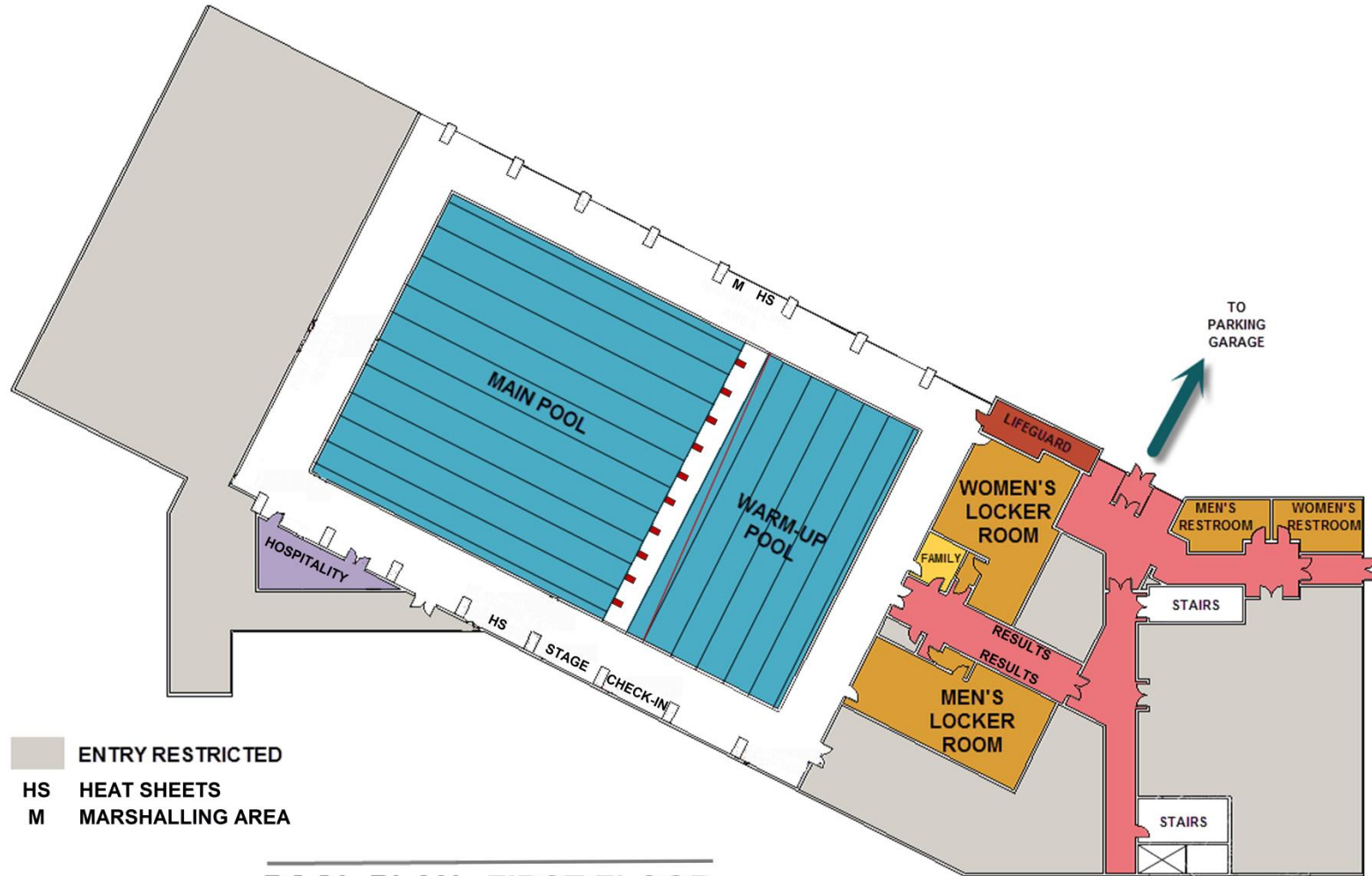
POOL PLAN - FIRST FLOOR