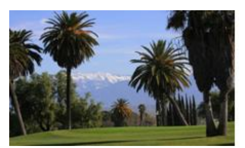
General Old, Riverside