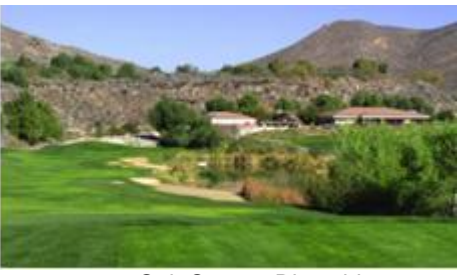
Oak Quarry, Riverside